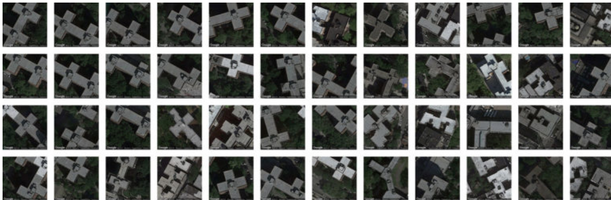
Public housing projects in New York City