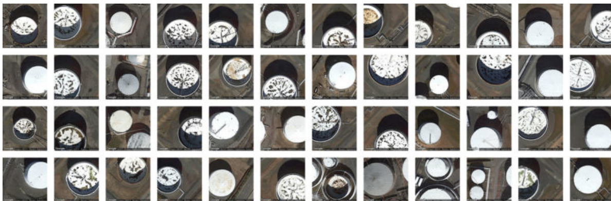
Rusting fuel tanks in New Jersey